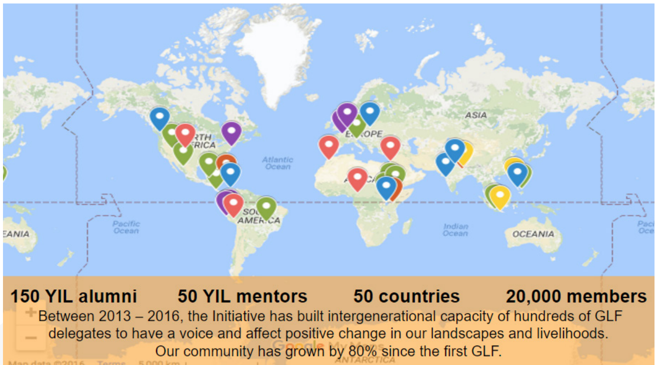
Image: Alumni Stories map, showcasing the impact YIL participants are having on their landscapes

Since 2013, when the Initiative was founded at the first Global Landscapes Forum, it has grown into a global network for change.