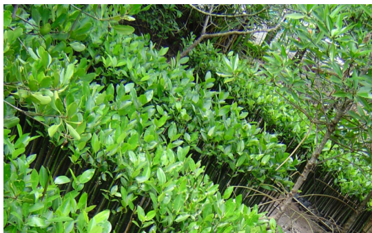
Tree Nursery

The target groups include, in particular, forestry and environmental policy makers in international initiatives and poor, rural population groups in selected countries. Women and young people will receive special support.